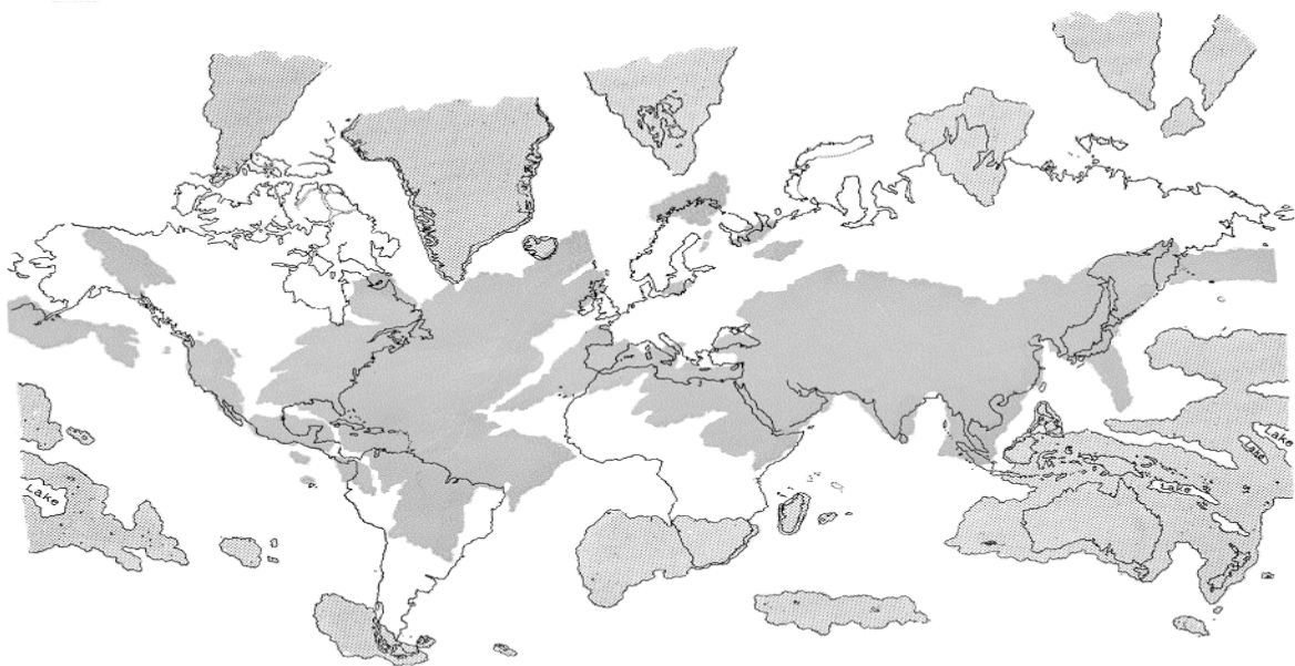
I. The World as it was 800,000 years ago Red—Atlantean Continent Grey—Lemurian Continent.

Ordinary geology, as I have said, makes it certain that such changes have taken place, but it does not tell us when they happened. Clairvoyant research does tell us when the changes occurred, and more than this, gives us actual maps of the earlier configurations.