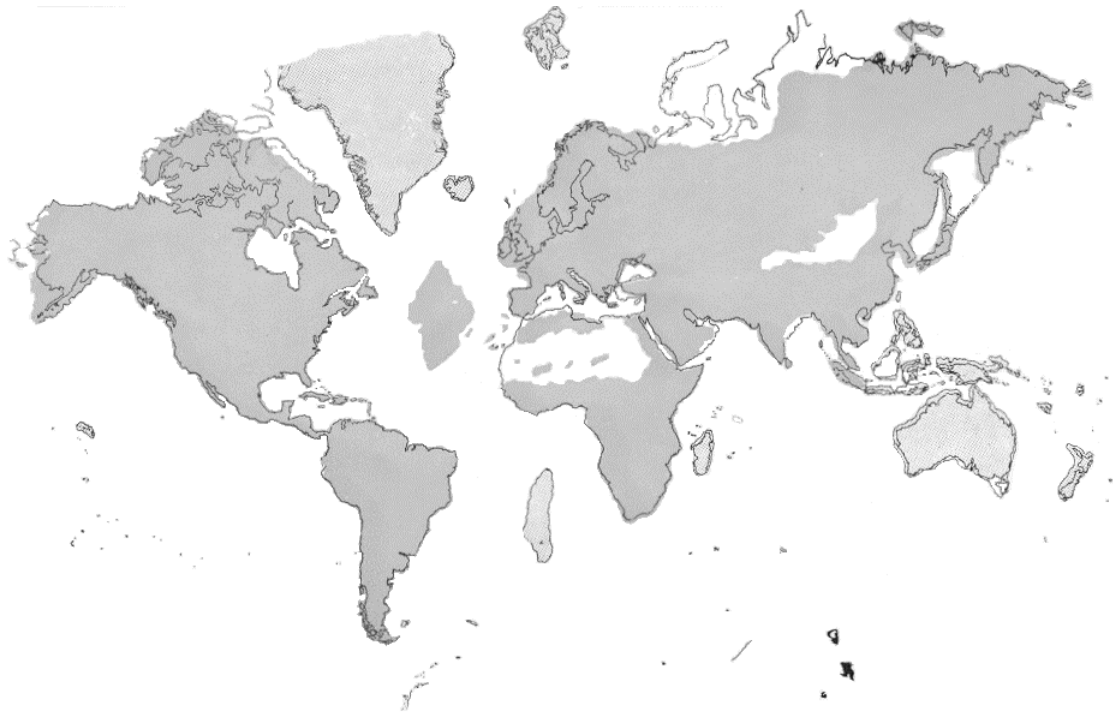
II The World as it was 11,500 years ago. Red—Atlantean World. Grey—Remains of Lemurian World.