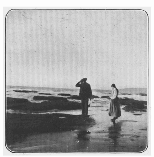
GATHERING SHELLS ON THE BEACH AT POINT LOMA, CAL.

"Tell those children of the Earth, for me, that the future happiness of all the creatures of the Earth is in their keeping, and if they will keep their minds pure and sweet then all the rest of humanity and all the other kingdoms will be compelled to think good thoughts, and when all envy, ambition, avarice and passion shall have disappeared the people of the sea can mingle with the children of earth and air and fire in completest harmony. They are the masters, we the servants, and although humanity compelled us to rebel against the wrongs inflicted, we would far rather have good masters and render the homage of love. Tell the children that they have it in their power to help the mermaids and mermen to become conscious servants of Truth."