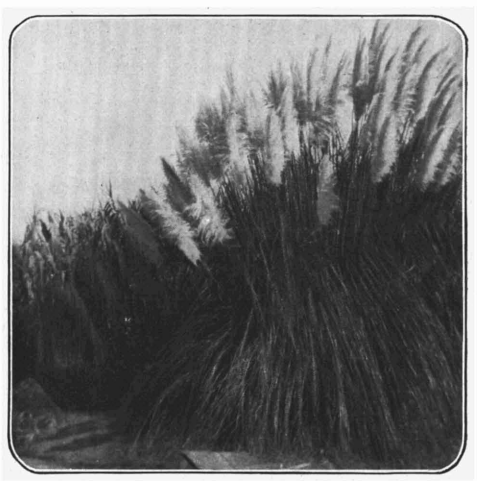
PAMPAS GRASS, POINT LOMA, CALIFORNIA.