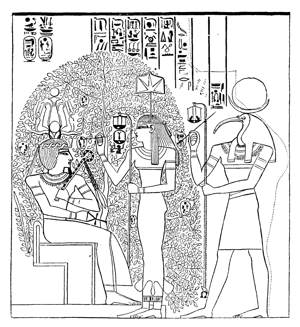
The god Thôth and Sufekh (goddess of History) writing the name of Rameses II. on the fruit of the Persea (Relief from the Rameseum) at Thebes.

him not deserving of funeral honors. For Rameses had not heeded their pretensions of superior right to kings, but, like Jeroboam of Israel, had set up a distinct priesthood of his own.