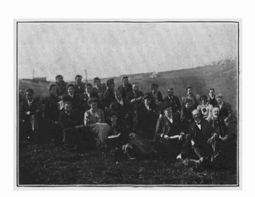
GROUP OF DELEGATES TO THE UNIVERSAL BROTHERHOOD CONGRESS AT BRIGHTON, ENGLAND, OCTOBER, 1899.