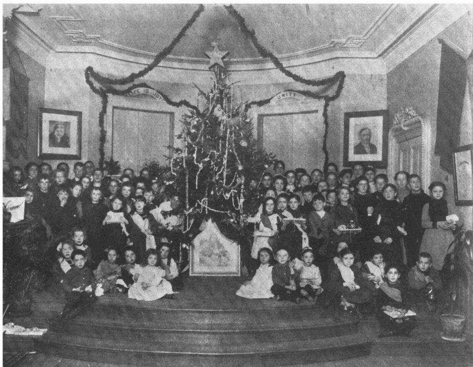
FESTIVAL OF THE LOTUS GROUPS IN BOSTON, AND NEIGHBORHOOD