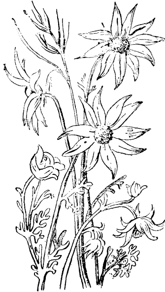
FLANNEL DAISY — Actinotus Helianthi

Between plants, rocks and trees, the bracken fills in the gaps with its strong green fronds, and here and there a yellow one, just for variety, for Mother Nature is an artist. which I am sitting is a loving eye notes its To paint it the whole of called into requisition vegetable would both and wind and weather it, while the soul of all the sandstone, yellow soft greys with touches or. In places the iron- this again is woven in- shades. Then the lich- story all over it in soft faded into irregular white. All shades of while others more de- masses, capable of be- These lichens, as we take us back to the dim of silence and half