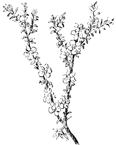
TI-TREE — Septospermum Scoparium