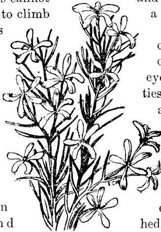
NATIVE JASMINE Ricinocarpus Pinifolius

TO look daily on one of the most beautiful panoramas imaginable, and say no word of it—to keep forever closed up impressions and pictures of nature's wondrous loveliness, and let none other participate, think you that is one's duty? "He that hath eyes to see, let him see." But many eyes cannot see. To reach my home I have to climb rather, track. Every step is seen to demand all riveted on the difficulties yond until, raising the light at so many beautiful masses of rock, purple wattle, dells of fern, murmur of trickling glimpses of heavenly lacing green of tree-tops. walk along a level, made uncompromising fences on conventional gardens, and strictions of conventional deadletter of things. People such a place, toiling backwards and forwards in all weathers? But what repayment for a little difficulty. Imagine the scene that greets you at last as you throw yourself down for well-earned recuperation after the daily toil. Mother Nature receives you straight into her arms,