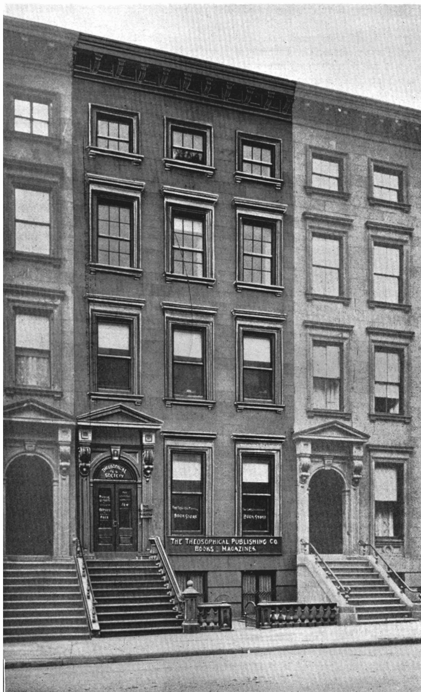
THE OLD HOME OF THE ARYAN THEOSOPHICAL SOCIETY, 144 MADISON AVENUE, NEW YORK ESTABLISHED MAY, 1892